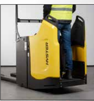
FIXED SIDE PROTECTION WITH REAR ACCESS