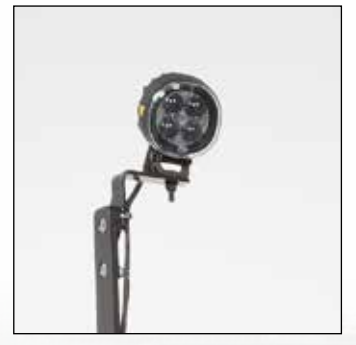
PEDESTRIAN AWARENESS LIGHTS