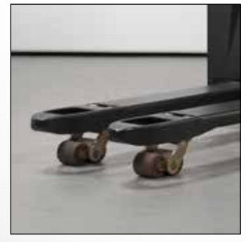
TWO FORK HEIGHTS