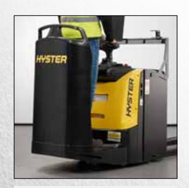
FIXED REAR PROTECTION WITH SIDE ACCESS (VIA SPECIAL ORDER)